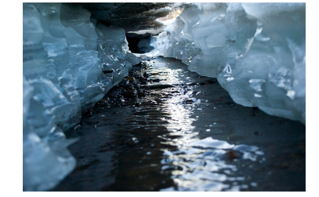
<u>Icebreakers – What makes</u> a great ice breaker activity?