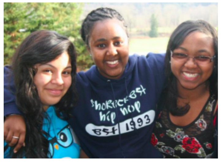
Facilitating with Friends and Family